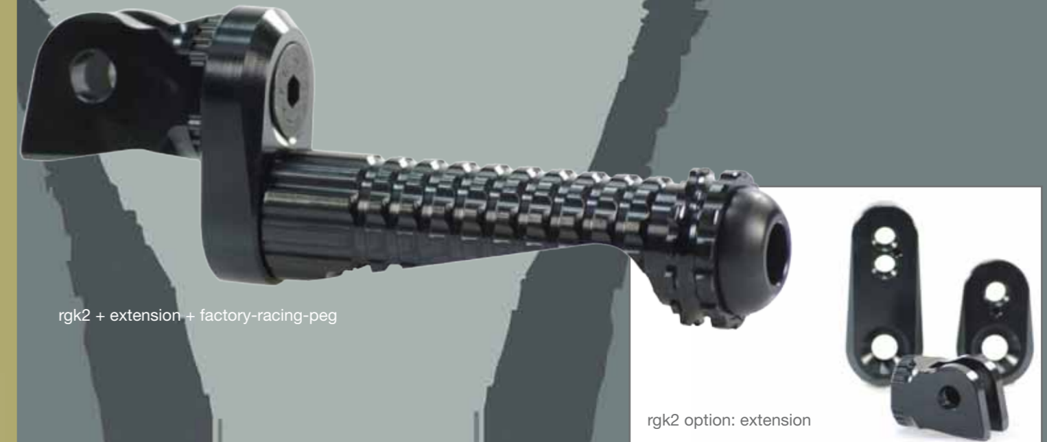
rgk2 + extension + factory-racing-peg