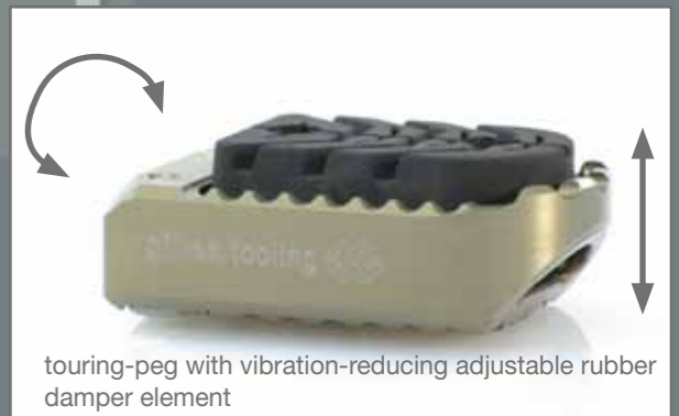
touring-peg with vibration-reducing adjustable rubber damper element

features • fits original footpeg mounting bracket for rider and pillion rider • foldable • optional: comfortable excenter adjustment by different extension arms (adaptability is bike specific) • allows lower pillion rider footpeg position • different footpeg designs available: • optional slide pad to reduce wear and damage for touring- and rct12.gt-peg • available in different hard anodized colors