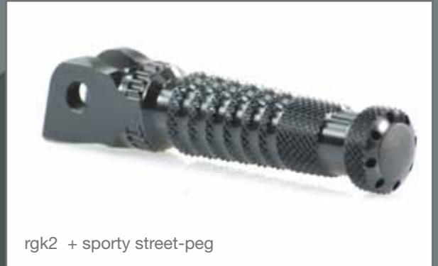
rgk2 + sporty street-peg