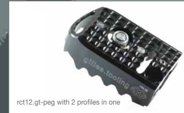
rct12.gt-peg with 2 profiles in one